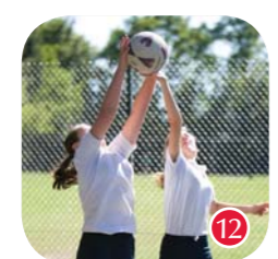
12 Tennis and Netball Courts