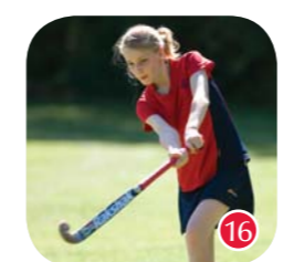
16 Sports Fields