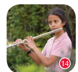
14 Music School