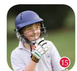
15 Sports Pavilion