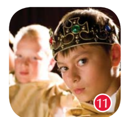
11 Drama Studio