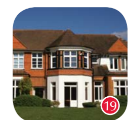
19 Drawing Room and Office