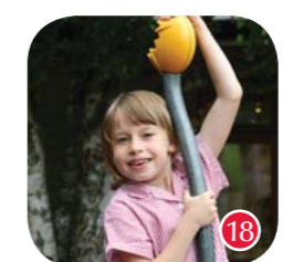
18 Pre-Prep Playground