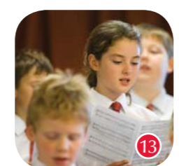
13 Fyson Blum Hall