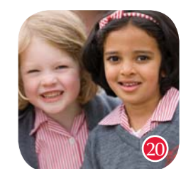
20 Pre-Prep Entrance