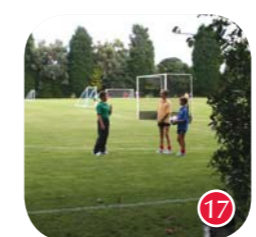
17 Field Gate Entrance