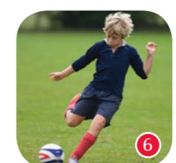
6 St Peter's Gate